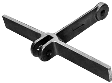
T type attachment

These light and precise chains are strengthened by our unique heat treatment technology. They are suitable for long case conveyors.