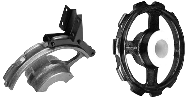
Saver type sprocket

Use of saver sprockets further reduces wear.